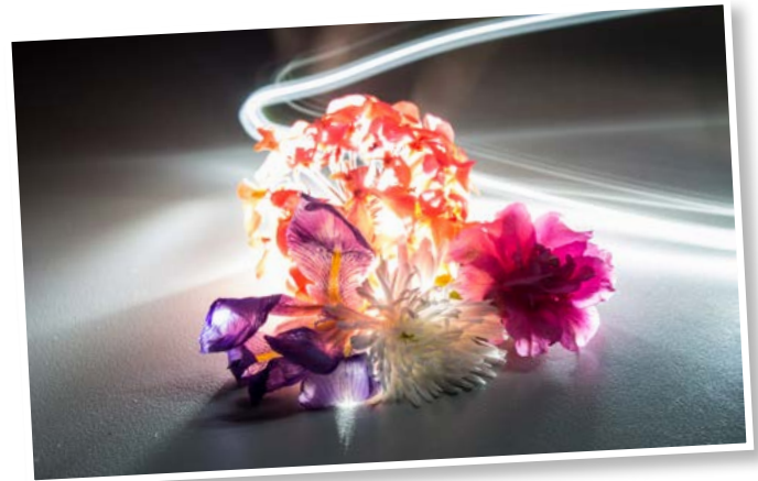
'Light Painting' digital photography by Jacob Shaw in Photography 2